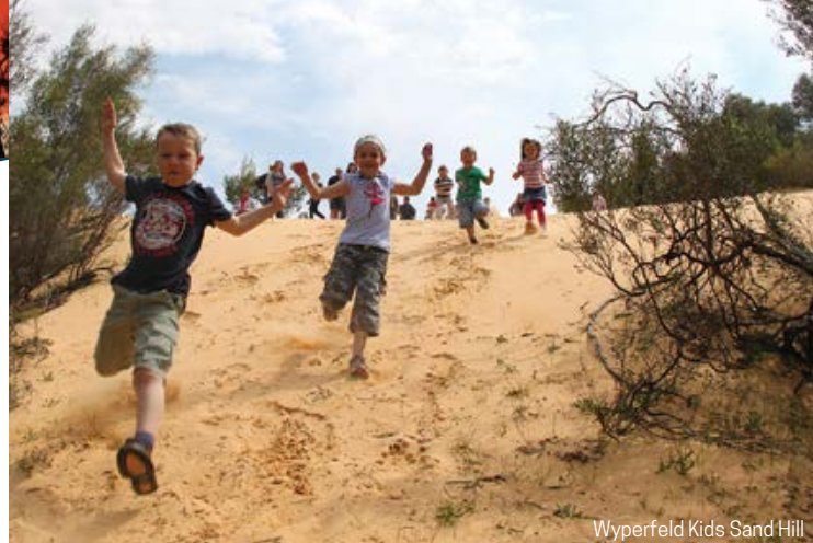
Wyperfeld Kids Sand Hill