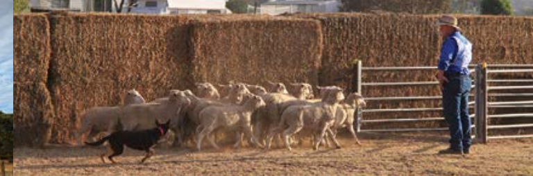
Patchedwollock Sheep Dog Trials