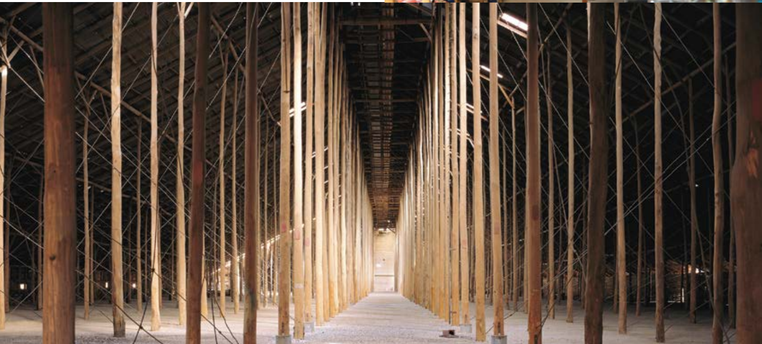
The Stick Shed, Murtoa