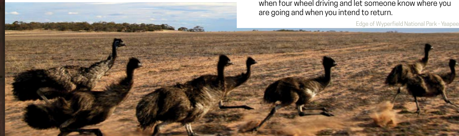
Edge of Wyperfeld National Park - Yaapeet