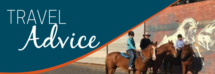
Horses at Beulah

To preserve the vulnerable natural environment visitors need to help by: - keeping to roads and tracks open to public vehicles, as wheel ruts last for years in dry sandy country; soil binding mosses and lichens can be destroyed and weeds and erosion introduced. Walkers too should keep to tracks for their own safety as well as that of the environment.