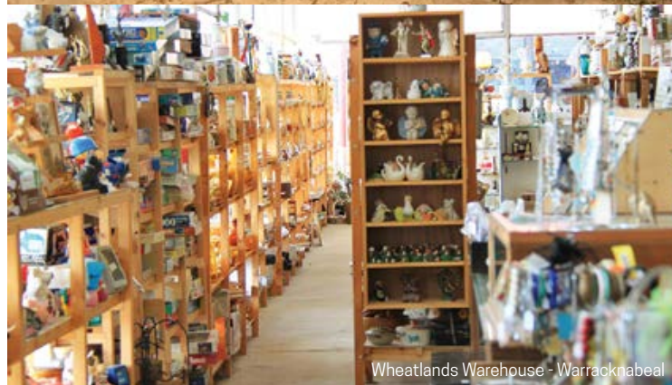
Wheatlands Warehouse - Warracknabeal

The Shire stretches from the Wimmera River just north of the Grampians in the south, to the centre of the Mallee in the north. The Yarriambiack Creek is the main natural feature traversing the Shire.